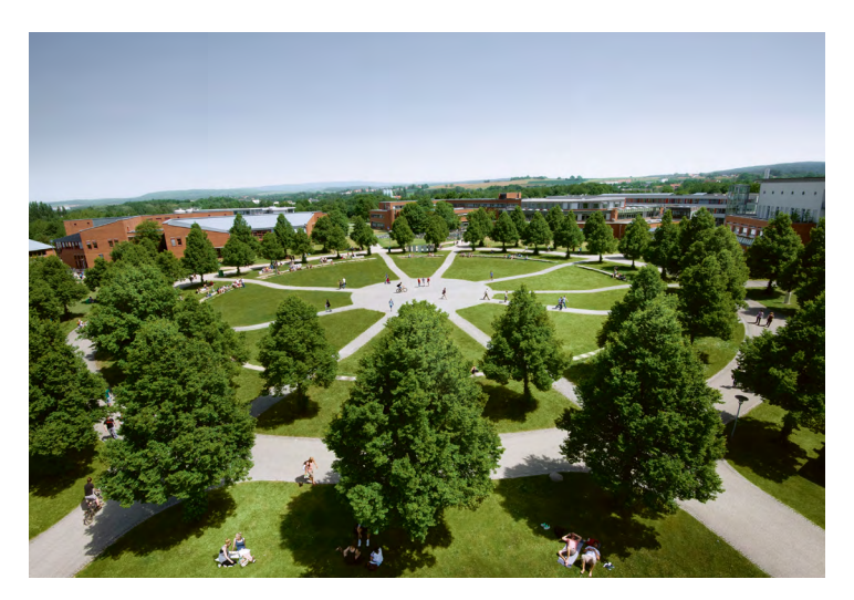
At the University of Bayreuth, you will find a range of opportunities for interdisciplinary exchange and focused research.