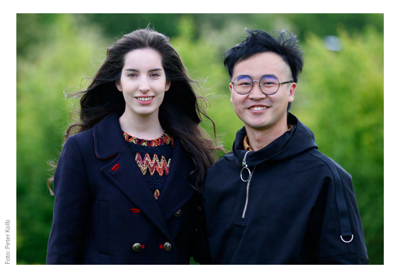
We offer you the opportunity to specialize in an individual area of emphasis by integrating other subject areas.