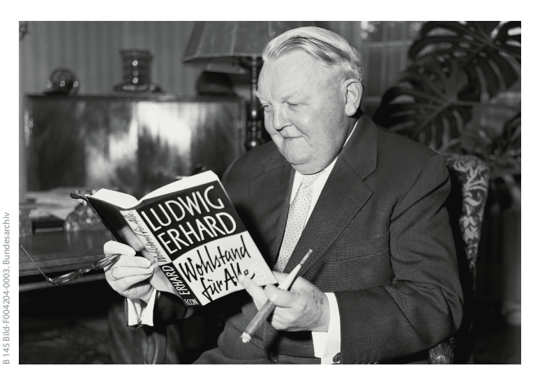
Economic historians with expertise in historical and statistical analysis enrich the research conducted at universities and are highly sought after by companies with strong quality profiles.